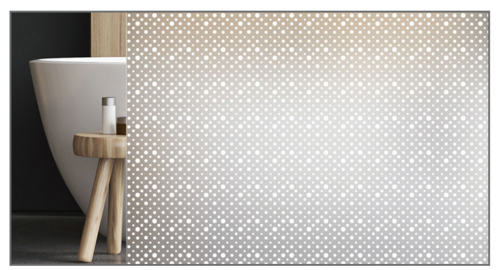
HPG_BCF_014 Printed on Acid Etched Glass