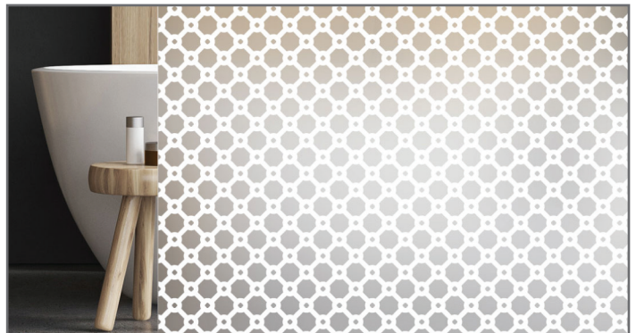
HPG_FUS_014 Printed on Acid Etched Glass