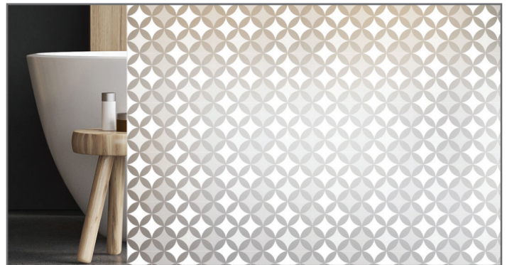
HPG_FUS_007 Printed on Acid Etched Glass