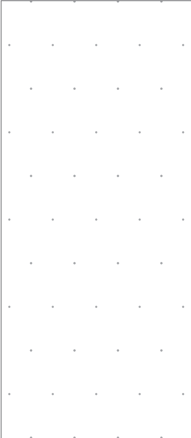
Pattern - HPG_BF_011