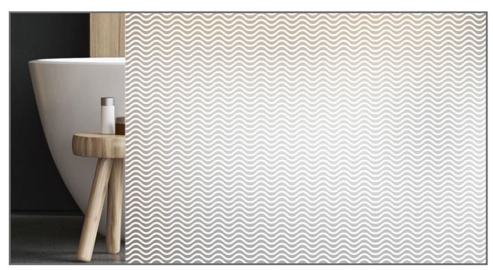
HPG_BCF_013 Printed on Acid Etched Glass