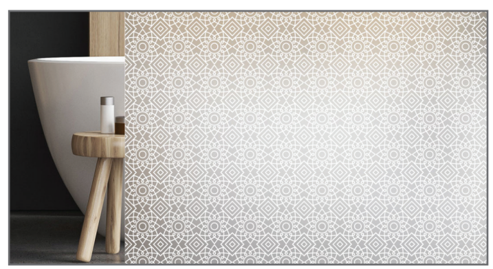
HPG_ORI_015 Printed on Acid Etched Glass