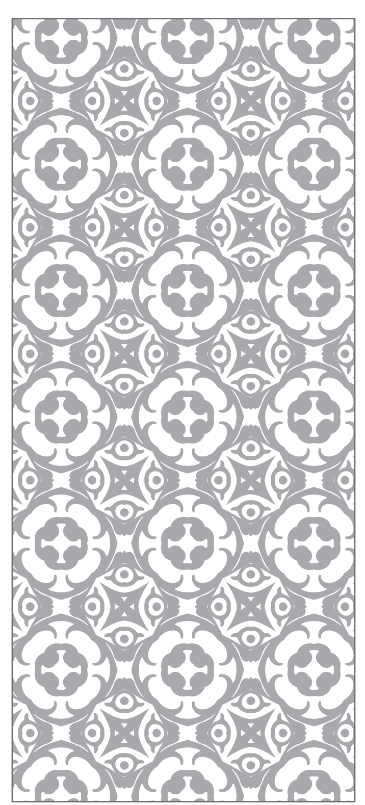
Pattern - HPG_FUS_006